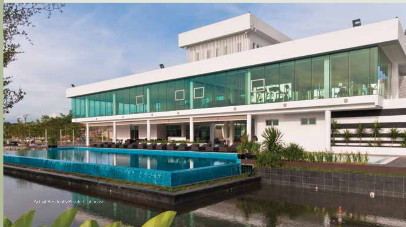
Actual Resident's Private Clubhouse