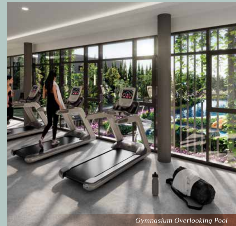
Gymnasium Overlooking Pool