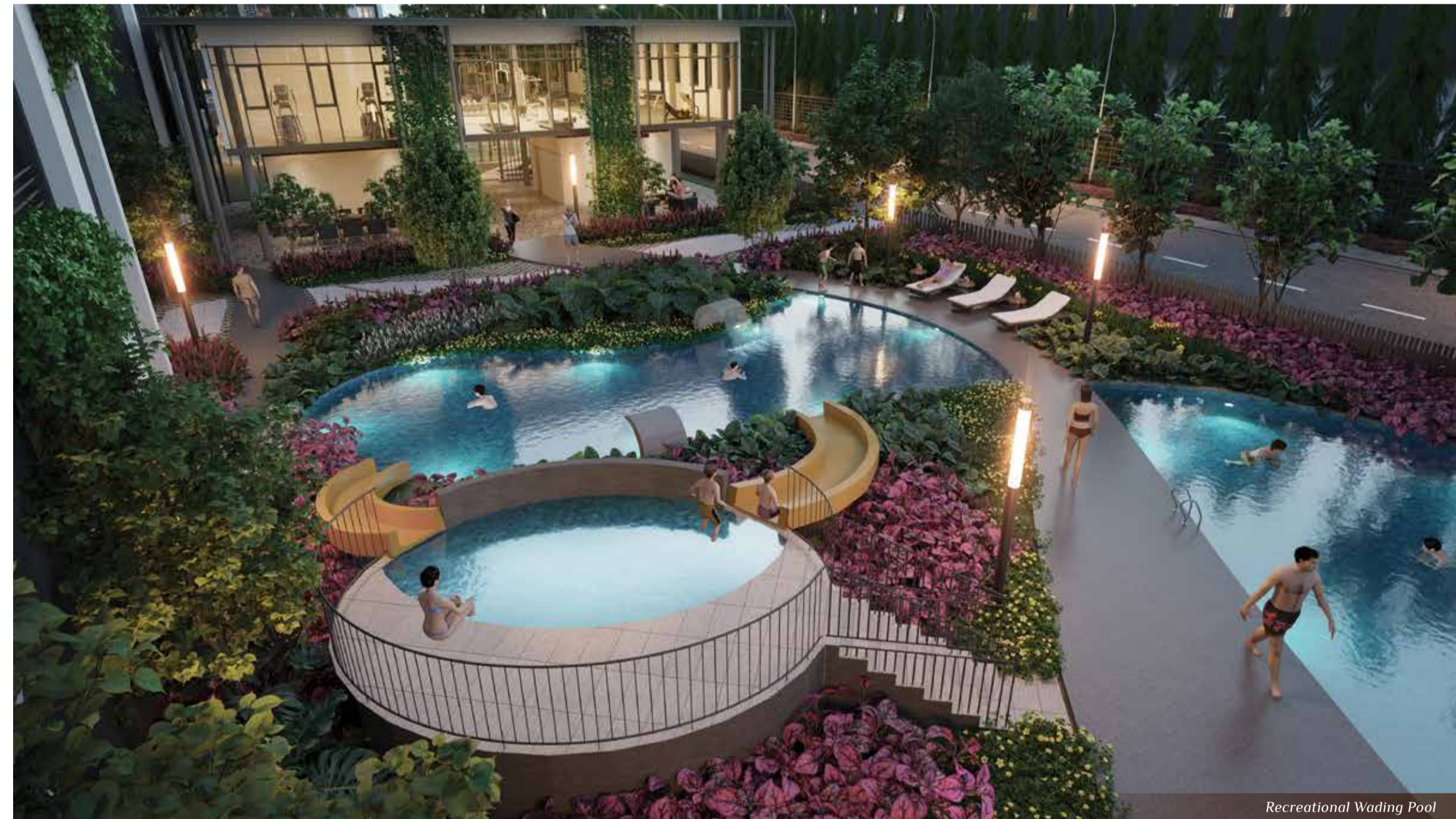
Recreational Wading Pool