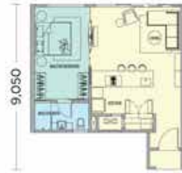
TYPE 1A 676 sq.ft.