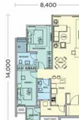
TYPE 2C 1,127 sq.ft.