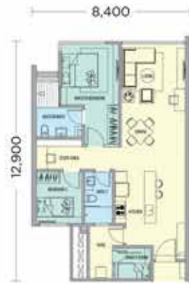
TYPE 2B 1,074 sq.ft.