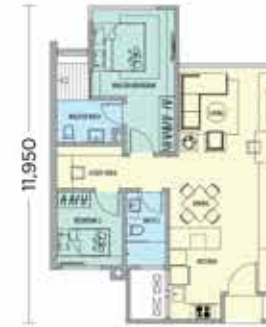
TYPE 2A 904 sq.ft.