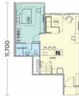
TYPE 1B 758 sq.ft.