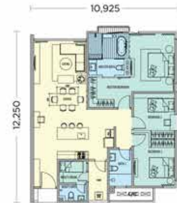
TYPE 3A 1,465 sq.ft.