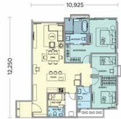
TYPE 3B 1,509 sq.ft.