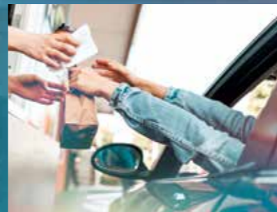
Retail with Drive-thru

Whether it is for leisure, productivity, and security, or the conveniences of digital lifestyle, be a part of a community where everything fall into place.