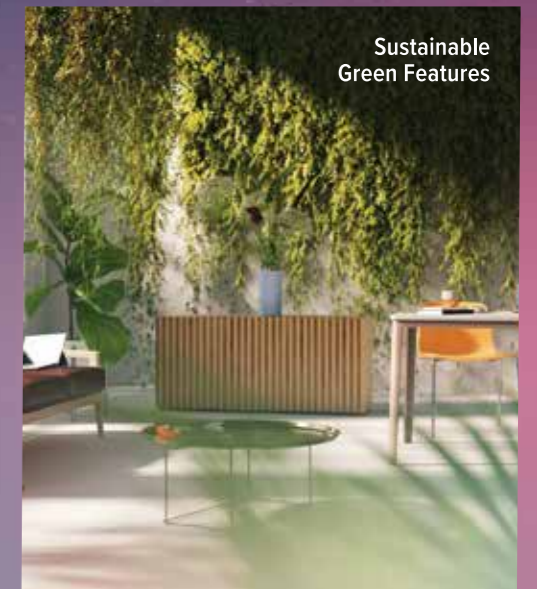
Sustainable Green Features