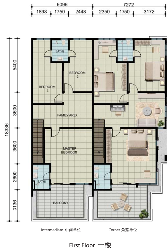
First Floor 一楼