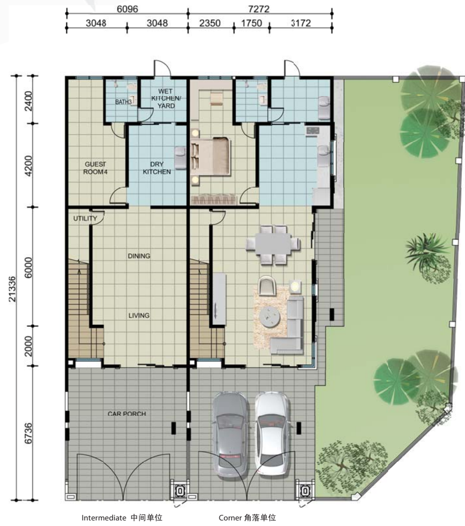
Ground Floor 底楼