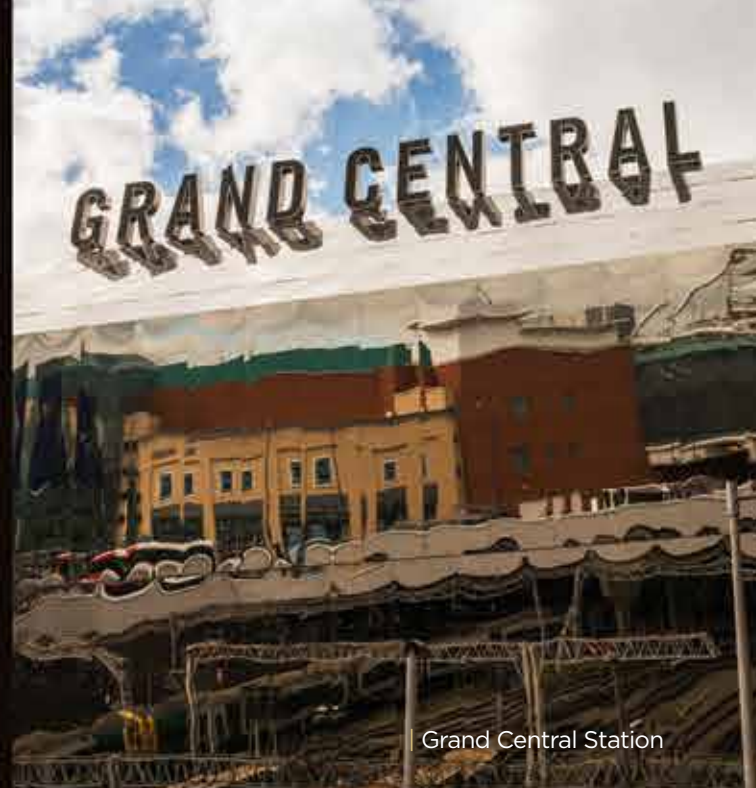
| Grand Central Station