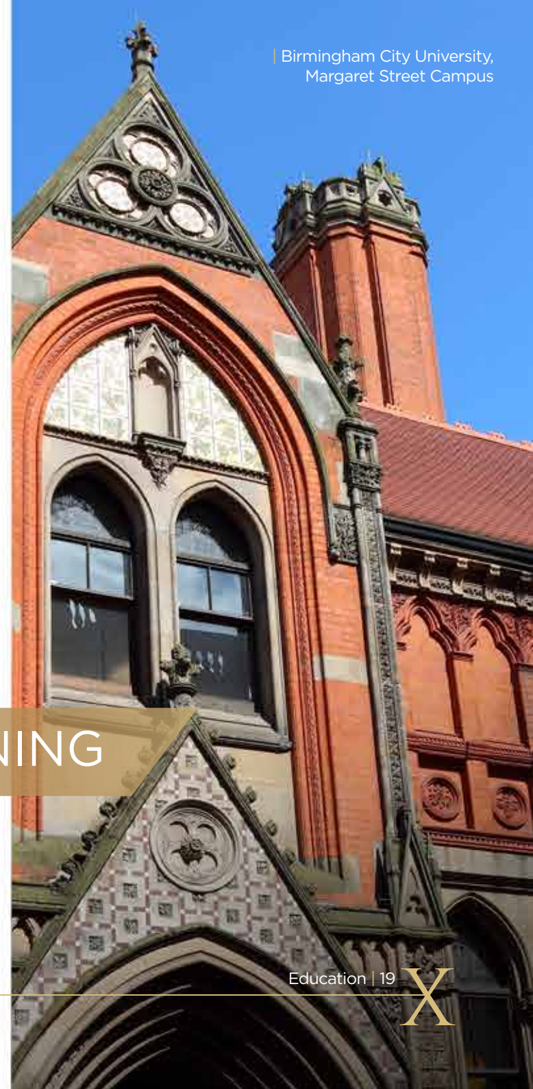
Birmingham City University, Margaret Street Campus