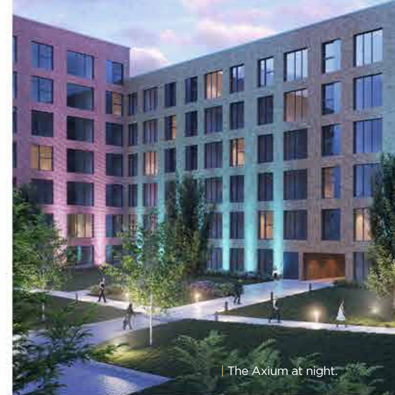
| The Axiom at night.